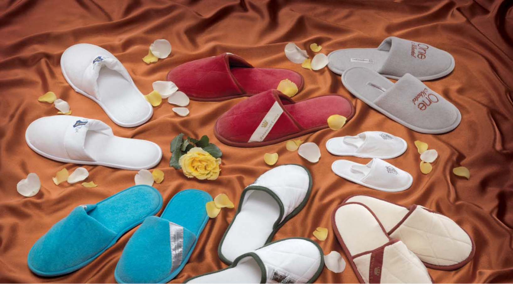
Guest Room Slippers